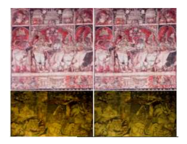
Step 3: Crack Filling Methods:

In the way of distinguishing breaks and isolating misclassified brush strokes, the last assignment is to reestablish the picture utilizing nearby picture data (i.e., data from neighboring pixels) to fill (add) the splits. Crack filling.